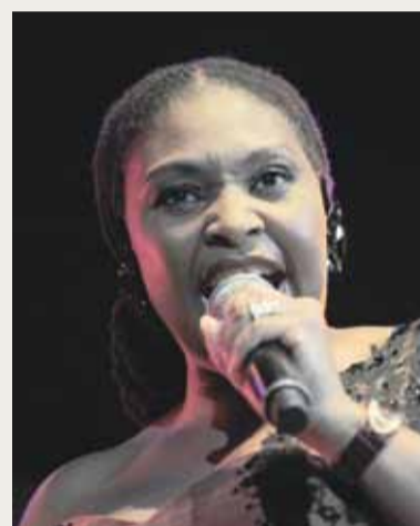
Ms Yvonne Chaka Chaka Mhinga.