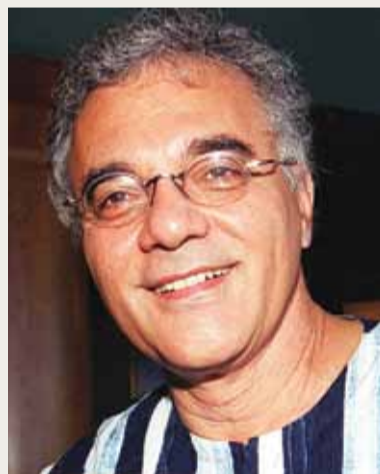
Professor Mahmood Mamdani.